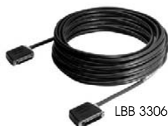
LBB 3306/20 shown

Use this cable to connect 6-channel Integrus Interpreter Desks when standard cables are too short. 328 ft. (100 m) installation cable without connectors.